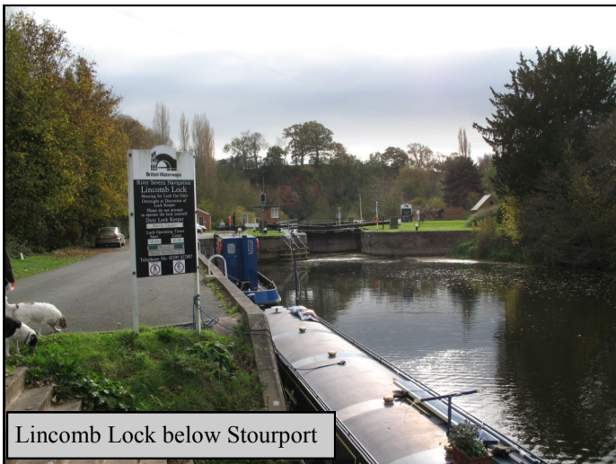
Lincomb Lock below Stourport