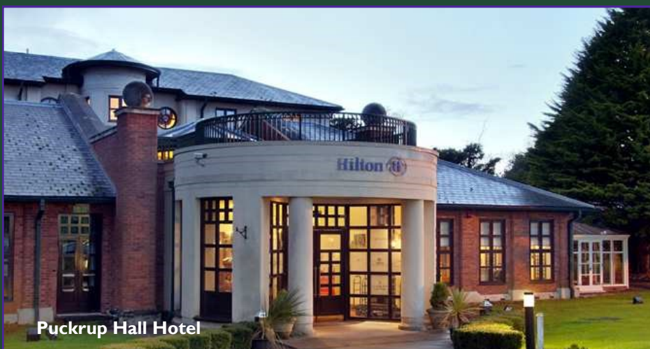
Puckrup Hall Hotel

Closing date for applications 31 st May 2014