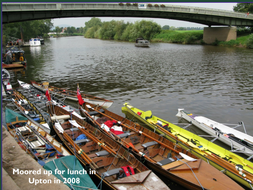
Moored up for lunch in Upton in 2008

We will be staying and taking our evening meals at the Puckrup Hall Hotel just north of Tewkesbury. This very comfortable hotel provides a swimming pool, gym, sauna, whirlpool, spa and golf course Puckrup Hall Hotel