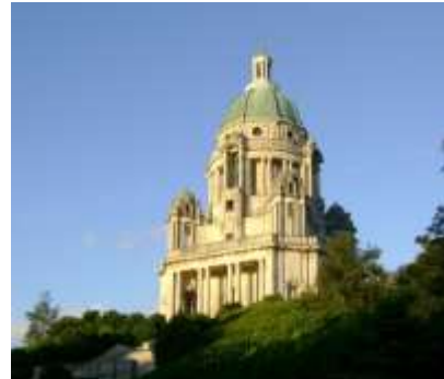
Ashton Memorial, Lancaster

One of the most scenic canals in the country, this gentle waterway offers wonderful views of the Silverdale coast, Forest of Bowland and rolling countryside of Wyre. It was nicknamed 'the Black and White Canal' as it originally carried coal from the south and limestone from the north. The Lancaster Canal stretches over 41 miles from Preston to Tewitfield on one level, England's longest stretch of canal with no locks.