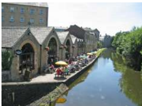
White Cross Public House, Lancaster

The canal, engineered by Scottish architect John Rennie, has more than 130 bridges and 8 aqueducts, the most impressive being the one over the River Lune, which is 664 feet long and 61 feet high. Construction of the canal started in 1792 and the final section, a 2 ½ mile spur down to the coast at Glasson Docks, was completed in 1826. The Millenium Ribble Link, opened in 2002, now joins the southern end of the Lancaster Canal to the rest of the canal network.