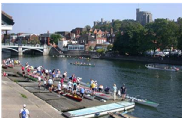
The 2003 FISA Tour at Eton