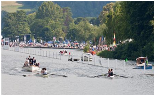
Henley Royal Regatta