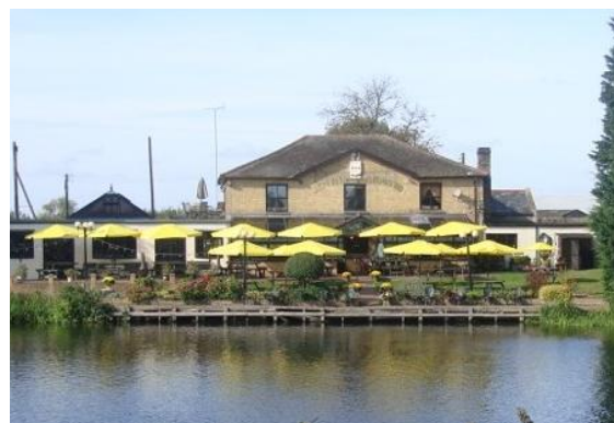
Jenyns Arms, Denver

This year's tour is organised by Weyfarers RC with support from St Neots RC, Isle of Ely RC and West Norfolk RC