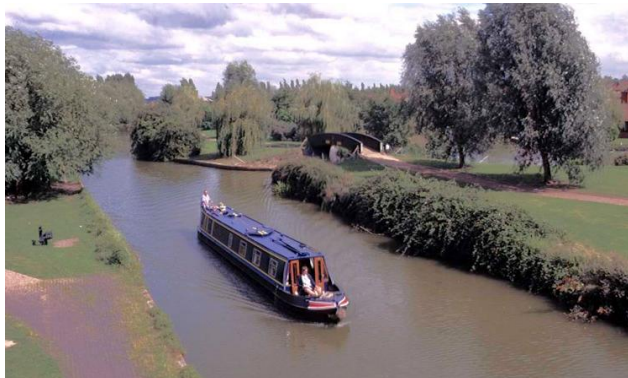
Aire & Calder Navigation