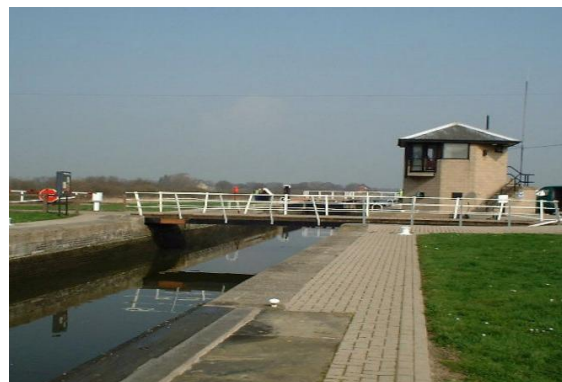
Barnby Dun Swing Bridge

This year's tour is organised by Weyfarers RC with support from Leeds RC, Pennine RC and Doncaster RC