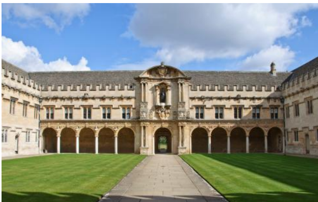
St John's College, Oxford