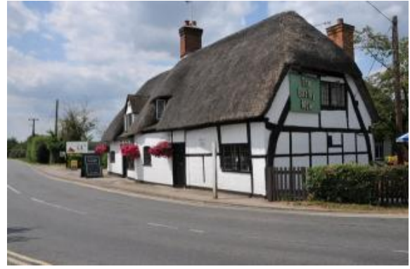
Barley Mow, Clifton Hampden