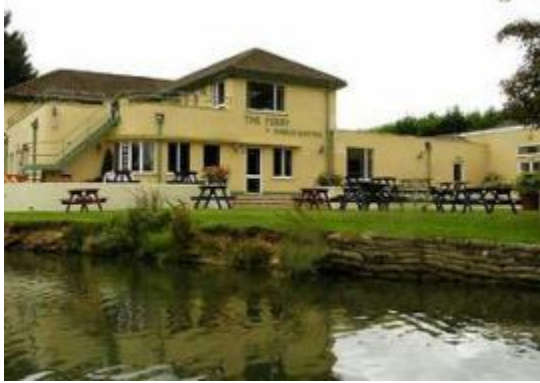
Ferryman Inn, Bablock Hythe