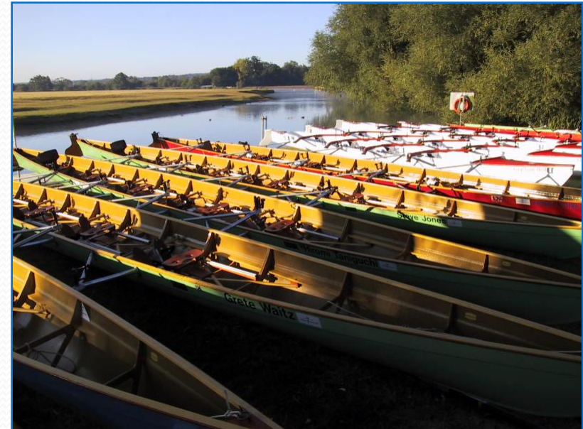
Boats lined up at Godstow ready for the 2003 FISA tour down the Thames